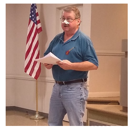
Labor Council Community Services Director reporting to September Labor Council meeting on planning for the Labor Council's October 5<sup>th</sup> Beer and Wing Night fundraiser.