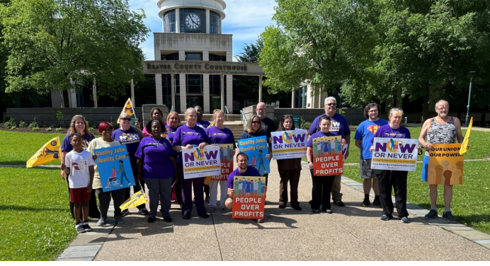
SEIU Healthcare PA represented nursing home workers rally in front of Beaver County Courthouse on June 8th