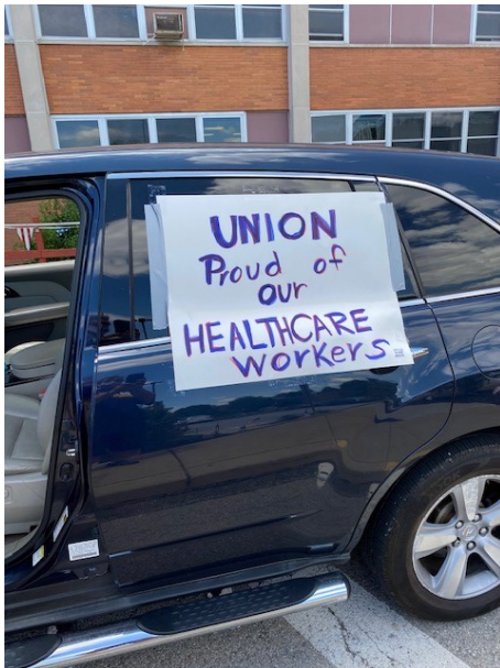
Sign on car in front of Brighton Rehab and Wellness Center in Brighton Township on July 20 th . The car was part of a Healthcare Heroes Car caravan that traveled to Beaver County nursing facilities with SEIU Healthcare Pa. represented employees. The Beaver County caravan was a part of a nationwide, one-day "Strike for Black Lives" that was organized by multiple labor unions, including SEIU, IBT AFT, United Farm Workers and many social justice groups.