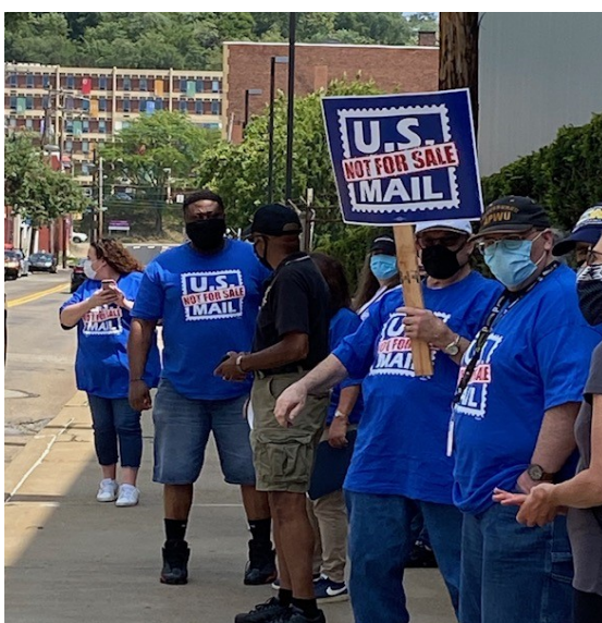
Postal Workers standing along California Avenue in front of Pittsburgh Northside USPS facility at August 25<sup>th</sup> rally.