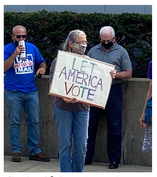
Sign at August 25<sup>th</sup> rally expressing concern that recent delays of mail as a result of policies of new Postmaster General Louis DeJoy will affect the outcome of the presidential election.