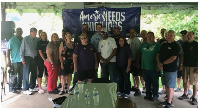
U.S. Rep. Conor Lamb (back row, center), with Labor Council delegates at picnic.

* Thank you to all who helped make the Labor Council's annual picnic meeting at Brady's Run Park on June 18 th a well-attended success. An America Needs Jobs Roundtable with Congressman Conor Lamb was included as part of the meeting and picnic.