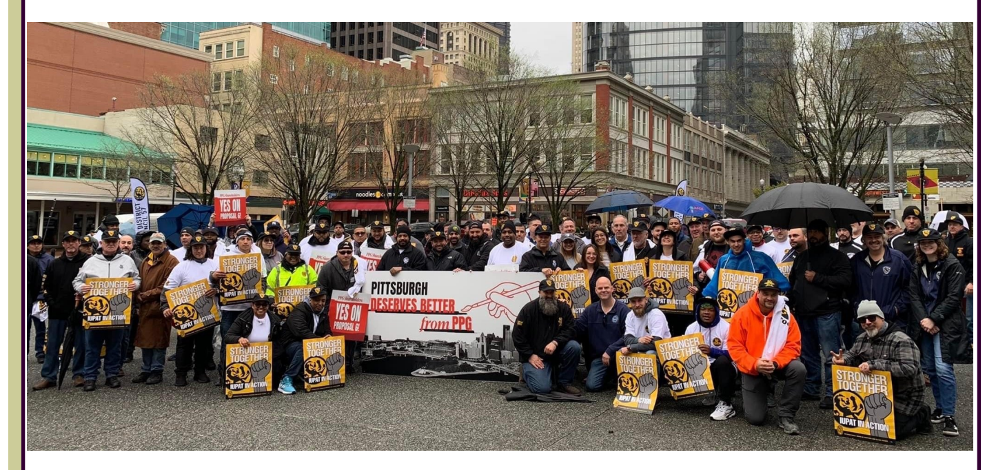
IUPAT District Council 57 demonstrating solidarity with AFL-CIO Reserve Fund's proposal at 2022 PPG annual meeting on April 21st.. The proposal calls for PPG to take into consideration the compensation of its work force and other workers necessary for its operations when setting target amounts for its CEO compensation. District Council's demonstration flyer states that "PPG CEO Michael McGarry makes 354 x more than the average PPG employee, and while PPG employees salaries have remained flat, the salaries of top executives have increased." The demonstration was held in downtown Pittsburgh's Market Square, located near PPG's corporate headquarters." IUPAT District 57's Local 530 is a member of the Beaver-Lawrence CLC.